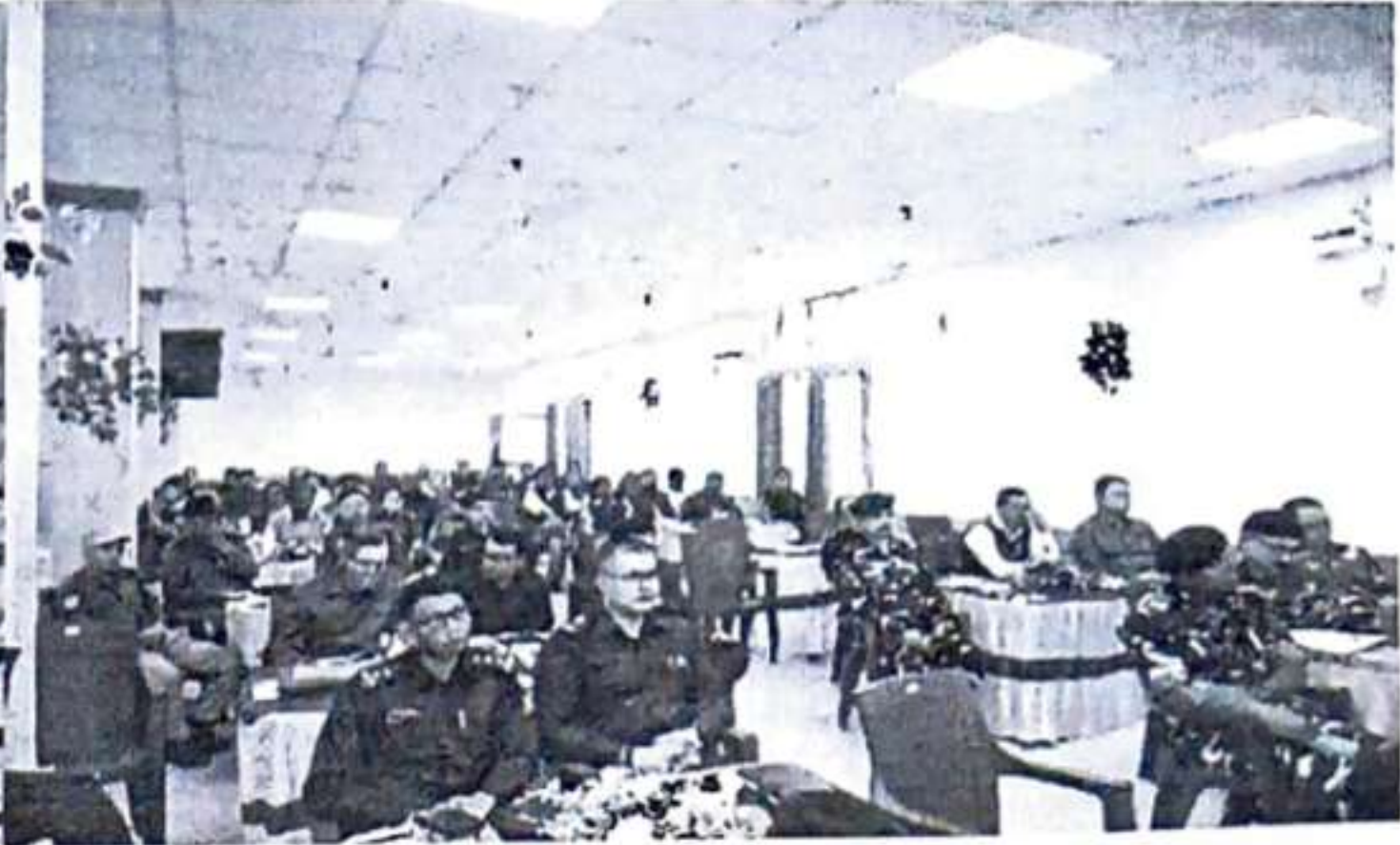
Orientation & Table Top exercise held on 6 th December, 2024 at DC Office Conference Hall