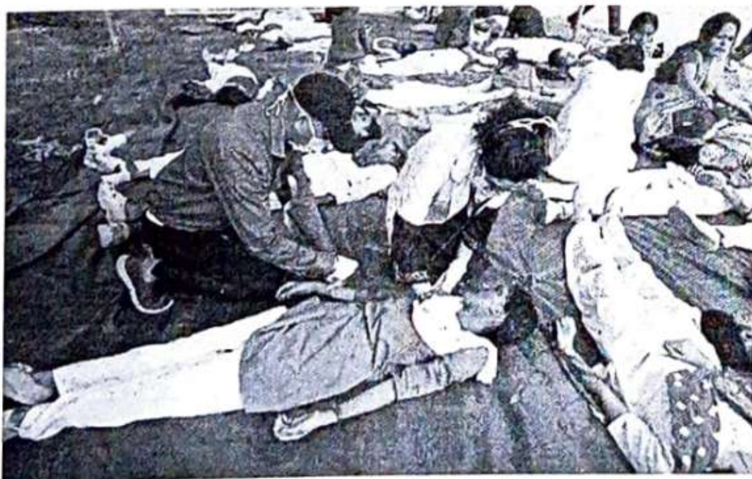
Medical aid at incident site