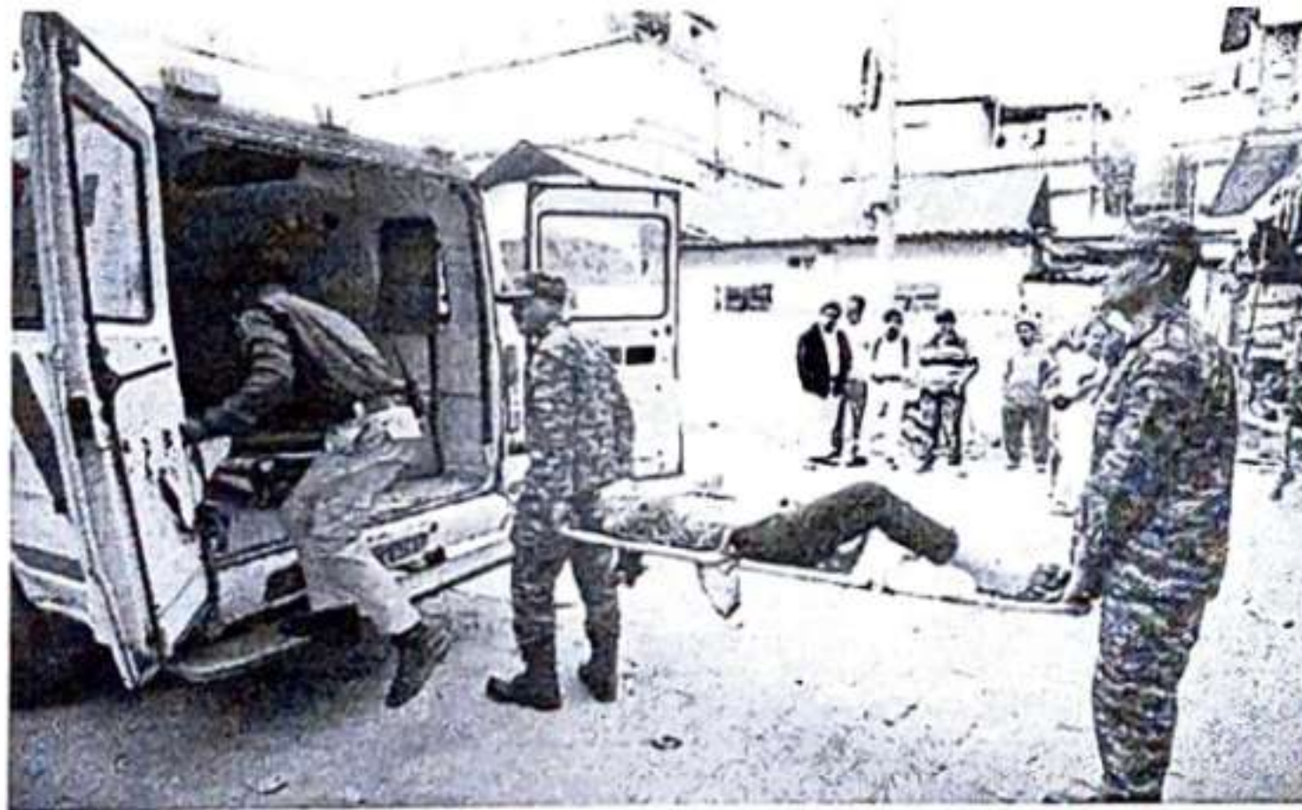
Transportation of casualties