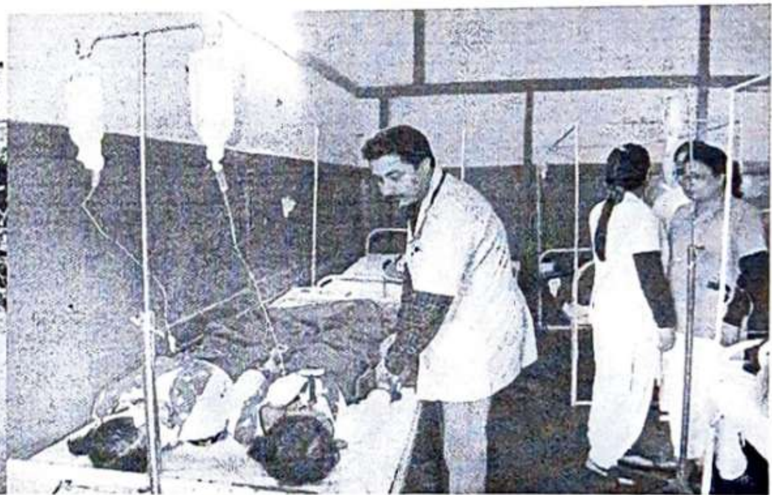
Treatment of casualties at hospital