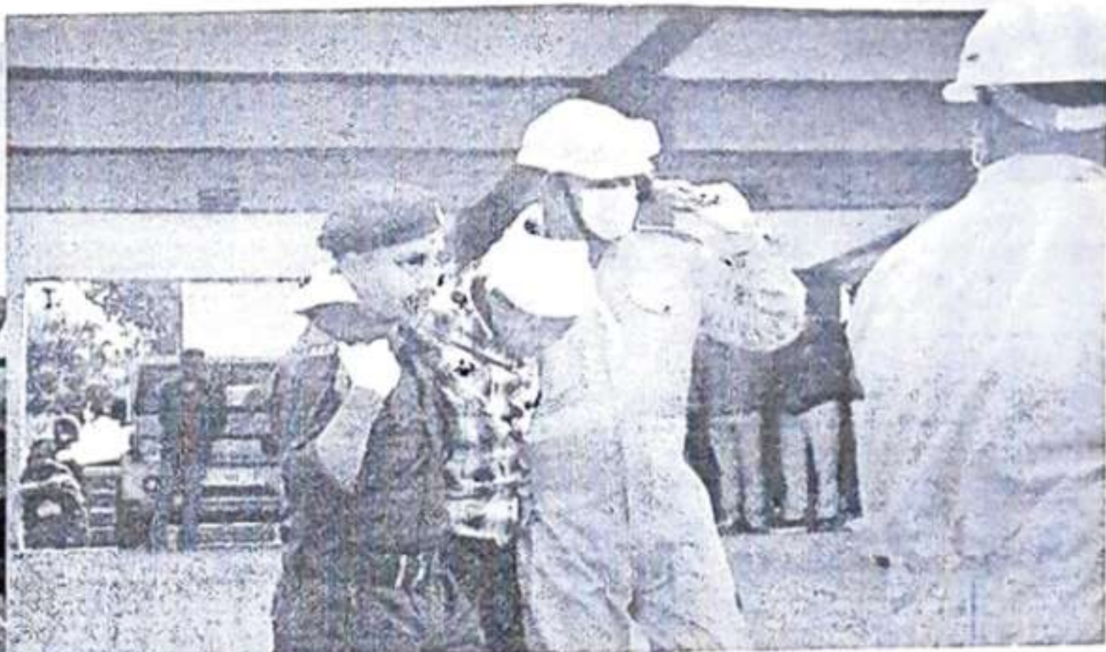
Search & Rescue at Apartment