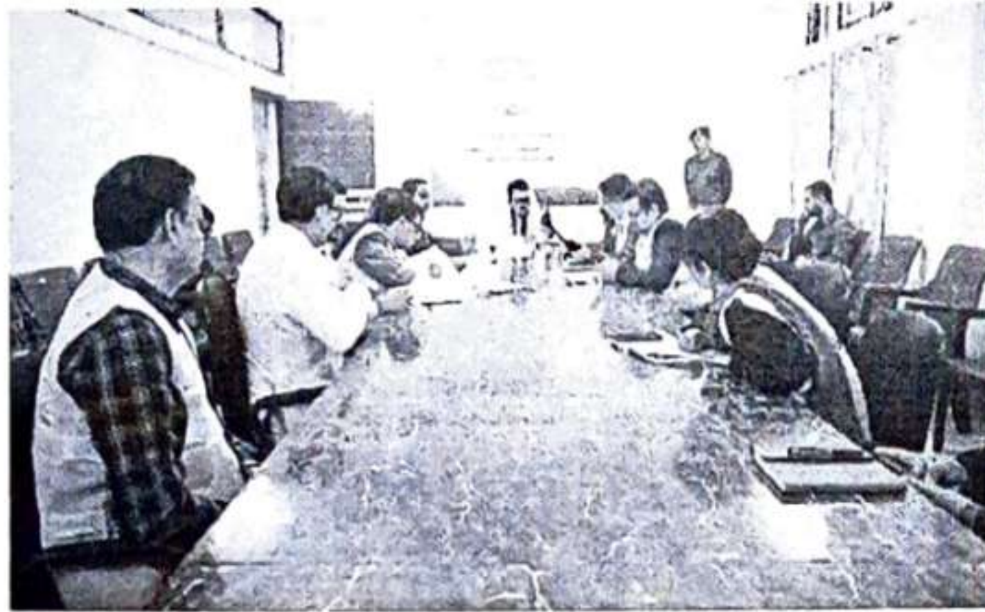
IRT Team at DEOC